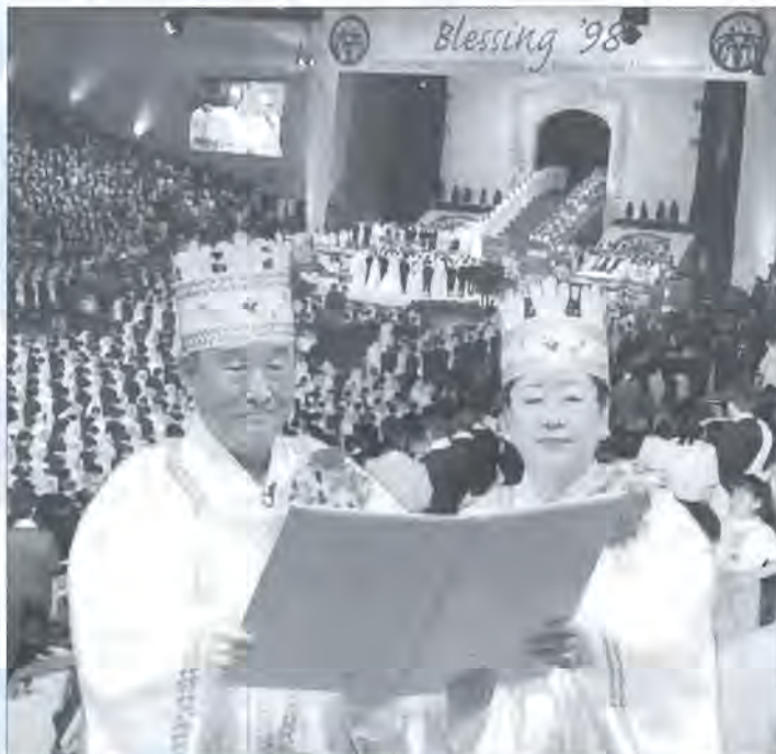
Front Cover: (Inset) True Parents read the four Blessing vows to the participants of the 120 Million Couples Blessing. (Center) Panoramic view of the main ceremony at Madison Square Garden.