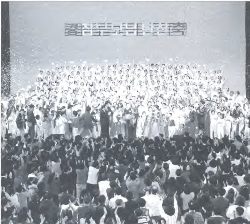
True Parents' Birthday Celebration in Seoul, Korea, on February 2, 1998.

I could not forget this land of Korea, which is to become the homeland, and I have come here again, Father. Now that I have come, You know the unspeakable things that are here. Thus I could not help but begin to hold the Hoon Dok Hae in order to tie together a foundation of heart. This is the homeland with which I have an eternal relationship, such that if I cannot live here in the Kingdom of God on earth, I will live here in the eternal Kingdom of God. Therefore, I came here and began the Hoon Dok Hae. Today the national messiahs from every nation of the world have gathered here to celebrate True Parents' Birthday. Leaders of the people and representatives of important organizations have also gathered together here. Heaven,