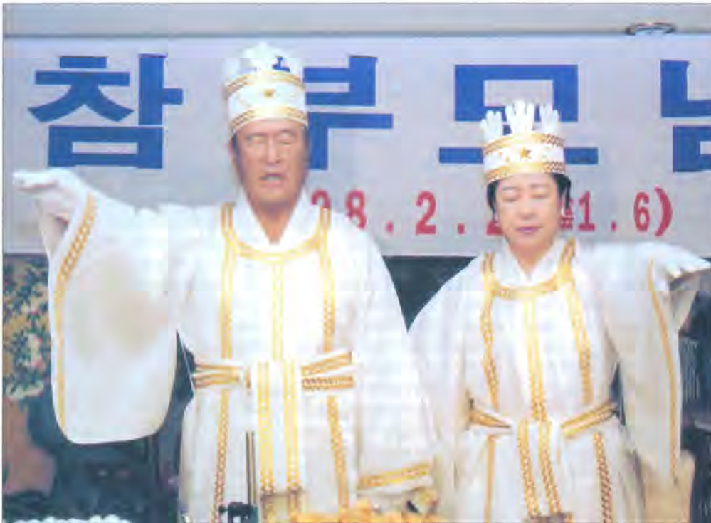
Prayer at Pledge Service on True Parents Birthday.

Therefore, Eve, the women, killed the third Messiah also, Reverend Moon. Christianity, as the bride on the world domain, exiled Reverend Moon. For this reason, through a course of 40 years in the wilderness, a second landing place was restored. This time now is representing the completion of the foundation of blessed couples worldwide 40 years ago, during the