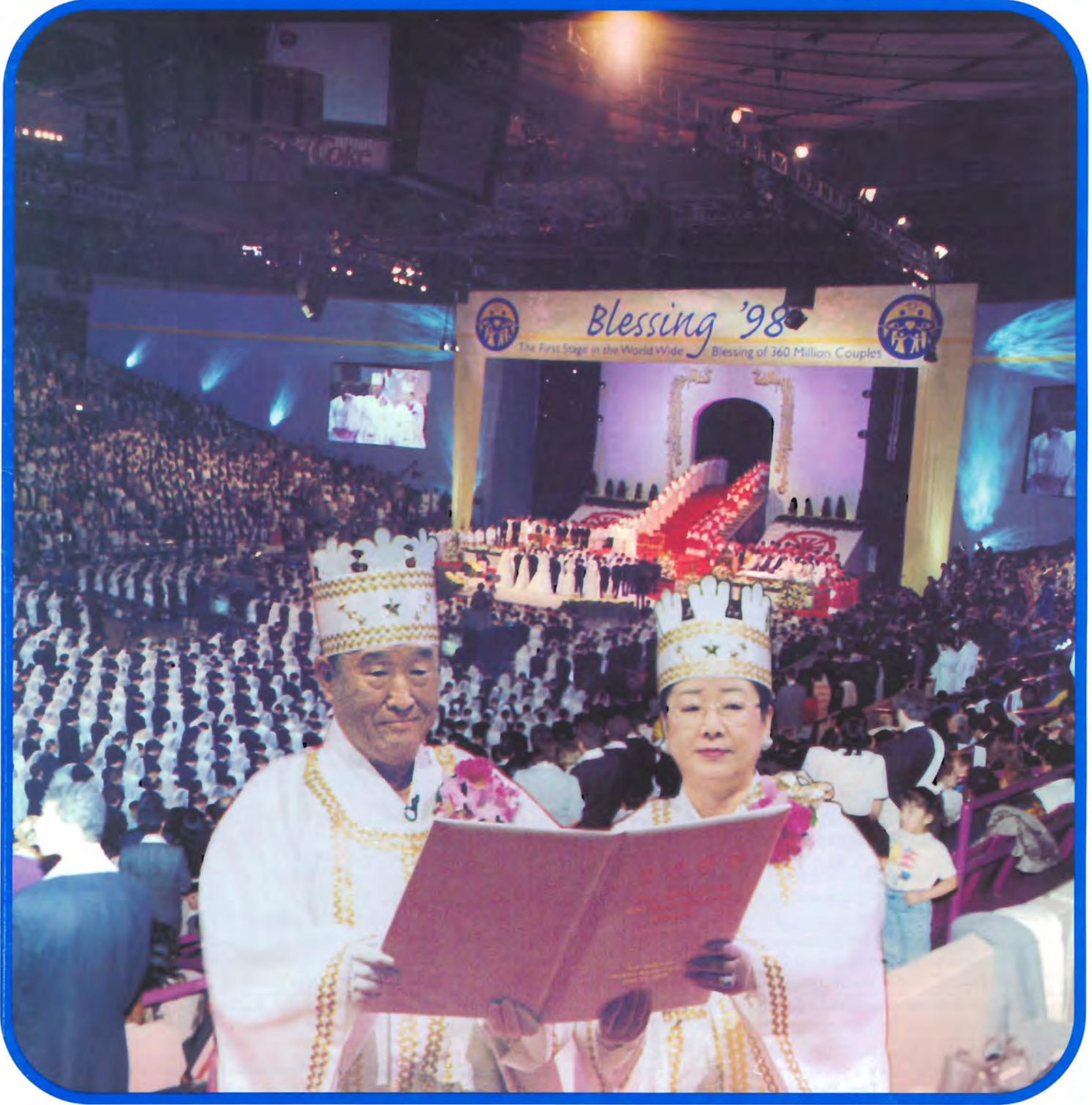
FATHER—"120 MILLION COUPLES BLESSING PRAYER"—"TRUE PARENTS' BIRTHDAY SPEECH" COLOR SECTION—BLESSING '98 AND FFWPUI VICE PRESIDENTIAL INAUGURATION