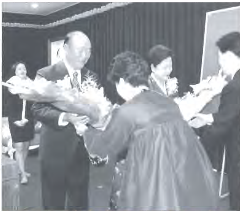
Flowers are presented to True Parents prior to Father's speech on True Parents Birthday.

I do not know whether some provincial governors have come today or not, but such people usually try to establish their authority. They tell others, "You must do what I say." They are very commanding. They do not realize that this is the fallen world. In regards to the daily life you have been living, does your body pull your mind around or does your mind pull your body around? This is the issue. Why does the body drag the mind around? What made it that way? We have not realized that it was because of the fall. We did not know about the fall. People who do not know about the fall cannot know about salvation. They do not think they are in need of salvation. People who do not know they have a disease do not think they need any treatment. Isn't it like that these days? It is the same as with something like cancer. People go along calmly for three or four years without knowing they have it, and then they die. Today, due to the human fall,